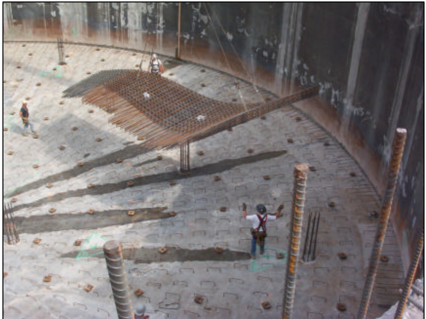
Pre-weld reinforcing segment lowered into clarifier.

32 outer pre-welded mat segments and 16 inner pre-welded mat segments.