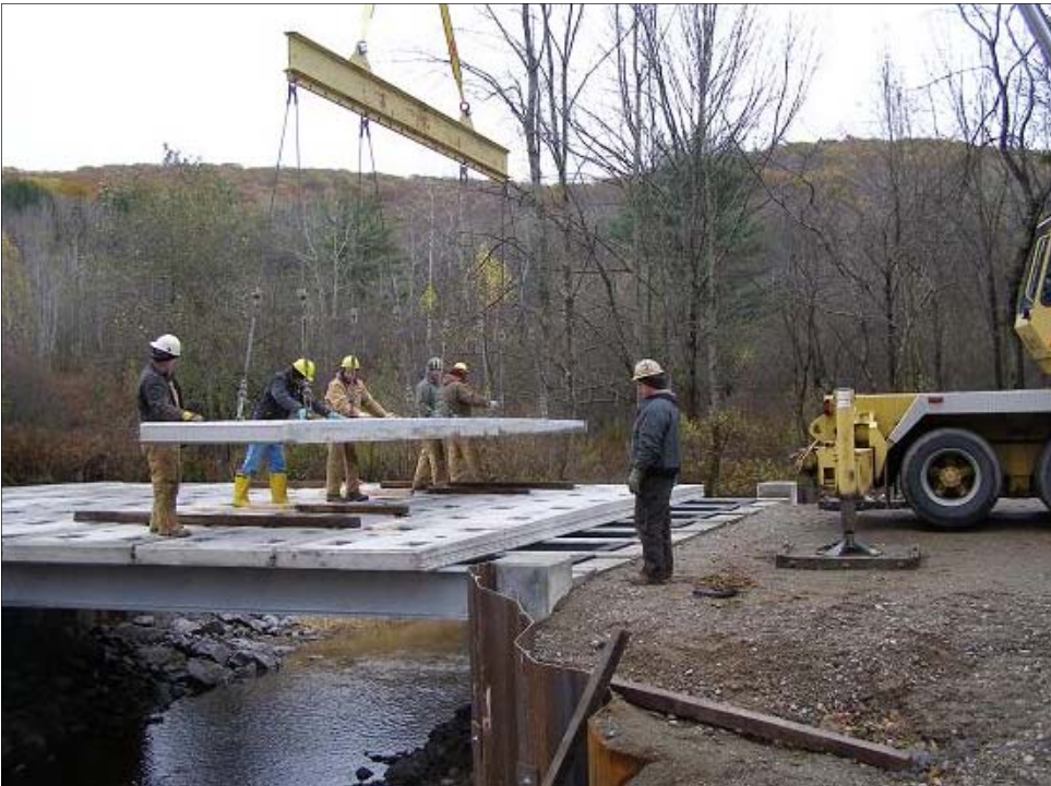
Stainless steel reinforcement with reduced cover used for precast deck slabs on Allegany Bridge 20

The decks of two small bridges in Cattaraugus County, in Upper New York State were constructed with stainless steel reinforced precast concrete modules, instead of a traditional cast-in-place construction methodology. The decision taken by Cattaraugus County Department of Public Works, Engineering Division to design and construct the decks using precast panels, allowed the County to construct the bridges with its own forces.