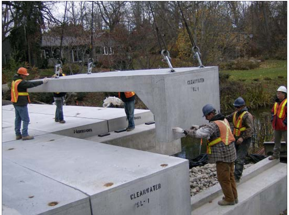
21 precast units with pre-assembled reinforcement used for 19.840-meter deck

Reconstruction of a small bridge over Young's Creek in the Town of Port Ryerse on the shore of Lake Erie is an example where modified standard products were used to construct a unique structure over a federally regulated creek. The pre-assembled reinforcement of the precast units was supplied by StelCrete.