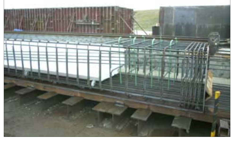
Reinforcing cage for 25 metre long box girder beam

Easy to use Accurately built Economical On time delivery Ready to place Reduces site storage requirements