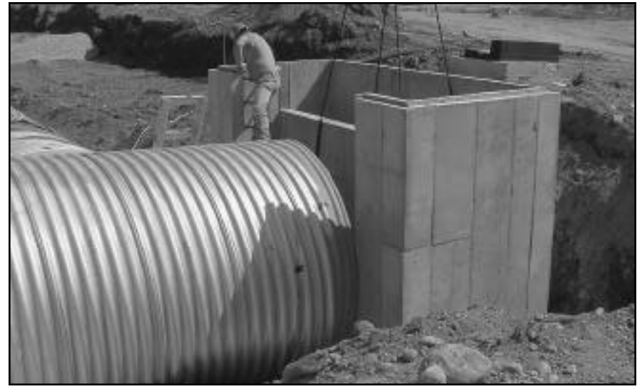
Installing detention facility controlled outlet structure

Most major projects in developed municipal areas include similar storm water control systems. Many are built with underground concrete "rooms" to store water; standard precast products used for these applications are boxes, vaults, arches and culvert sections. All PCANY producer members, like A & R Concrete Products for the project pictured here, can supply products for these needs. Storm water detention facilities are major investments; using readily available standard precast units helps control this cost.