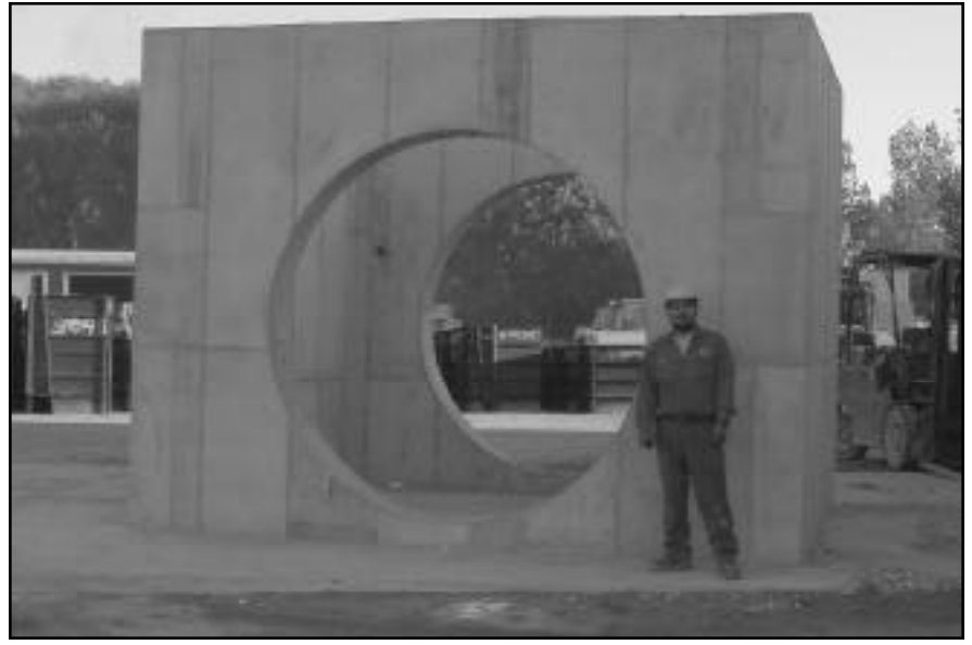
Catch basin walls and openings to human scale

Built like bomb shelters, and looking like the front entrance to a museum of modern art, these precast structures are designed to take a load! The owner, the Port Authority of New York and New Jersey, decided they needed to add an en-