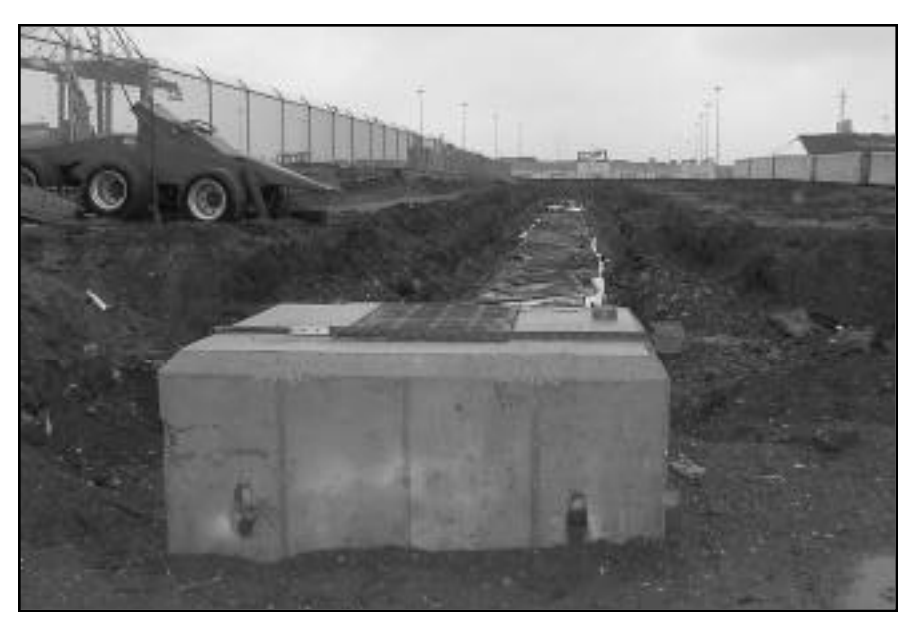
Curing footing for trench runs up to catch basin