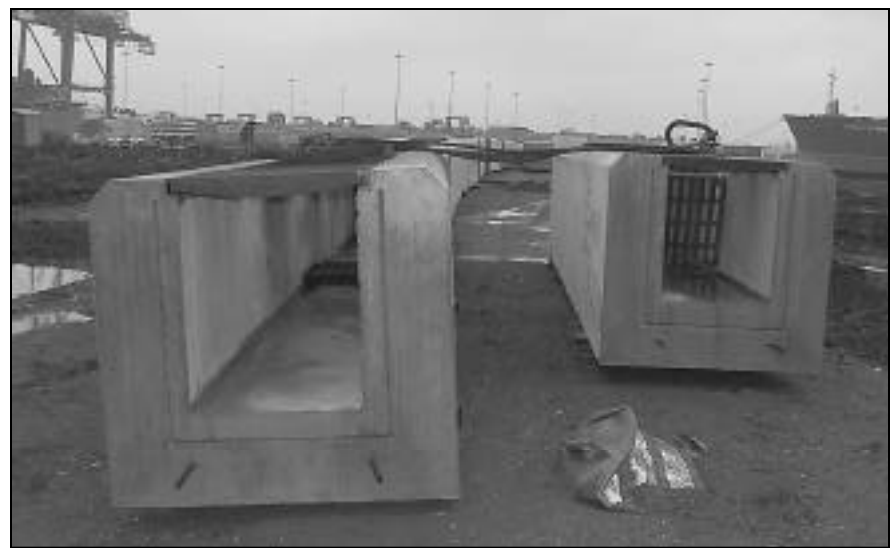
Precast storm water trench units ready for installation

Deep catch basins at run ends were also precast, and were built with extra thick side walls notched to receive the trench pieces. All trench pieces and catch basins were plant fitted with a heavy grating, supplied by Neenah Foundry Co.