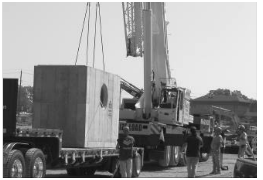
Unloading storm water controlled outlet structure

Precast concrete structures fill many needs. Large paved areas, as required at this Self Storage Facility built by Sun-Up Enterprises in Poughkeepsie, contribute significant storm water run off. To prevent damaging flows into municipal storm sewers, this business was required to build an on-site storm water detention system. The design called for hundreds of feet of large diameter pipe bedded beneath the property to accumulate the storm surge. This system ties into precast structures that serve as control outlets to insure controlled low flow leaving the site.