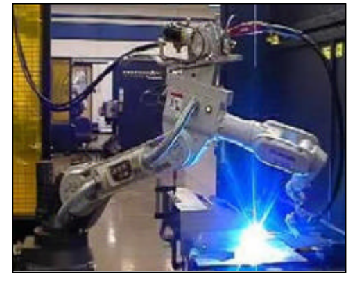
Panasonic Tawers ^{TM} PerformArc robotic welding cell.

The new facility is an existing twenty year-old 50,000 square foot building located west of Highway 406 and north of East Main Street. The building is currently undergoing modifications to accommodate two 10-tonne cranes inside, and an