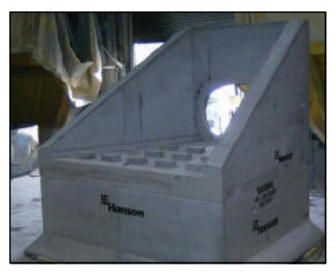
Precast concrete headwall system.

is currently producing products for three sizes of pipe. The jig is designed to produce single assemblies, but the capability exists for production on a far greater scale.