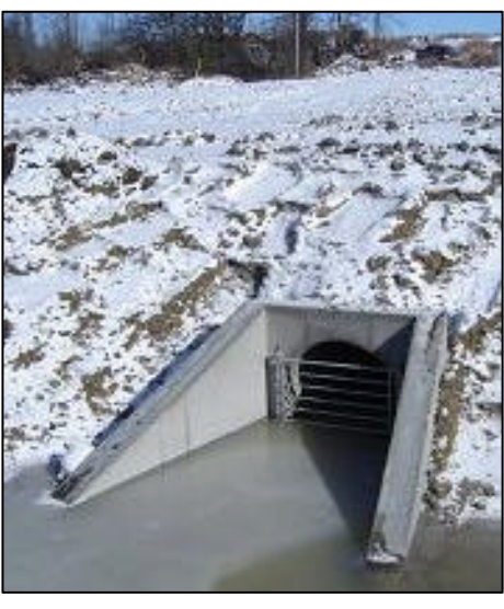
Functional Hanson Quick Headwall.