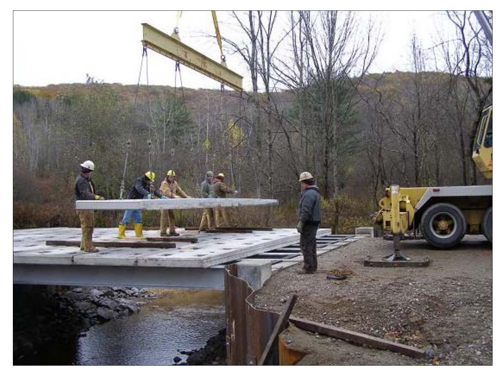
Stainless steel reinforcement with reduced cover used for precast deck slabs on Allegany Bridge 20

The decks of two small bridges in Cattaraugus County, in Upper New York State were constructed with stainless steel reinforced precast concrete modules, instead of a traditional cast-in-place construction methodology. The decision taken by Cattaraugus County Department of Public Works, Engineering Division to design and construct the decks using precast panels, allowed the County to construct the bridges with its own forces.