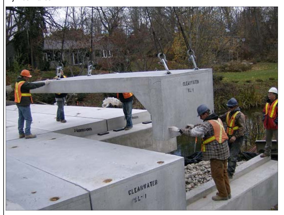
21 precast units with pre-assembled reinforcement used for 19.840-meter deck

Reconstruction of a small bridge over Young's Creek in the Town of Port Ryerse on the shore of Lake Erie is an example where modified standard products were used to construct a unique structure over a federally regulated creek. The pre-assembled reinforcement of the precast units was supplied by StelCrete.